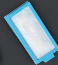
Ultrafine pollen filter