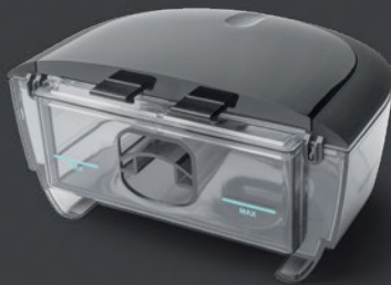
Water tank with lid