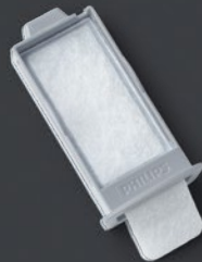
Reusable pollen filter